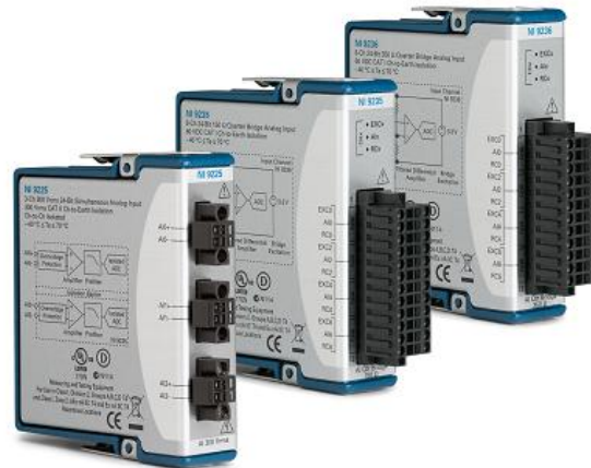
Figure 2. Three High-Speed Analog Input Modules

You have more than 50 C Series modules, most of which work with NI CompactDAQ, to choose from for different measurements including thermocouple, voltage, resistance temperature detector (RTD), current, resistance, strain, digital (TTL and other), accelerometers, and microphones. Channel counts on the individual modules range from three to 32 channels to accommodate a wide range of system requirements. C Series modules combine signal conditioning, connectivity, and data acquisition into a small module for each specific measurement type. You can insert these modules into any of the C Series chassis to create a variety of systems. You can create a mix of channel counts and measurement types within one system by selecting the desired modules and installing them into one of several C Series systems. For this reason, systems built on the C Series platform are highly customizable. See ni.com/crio/cseries for the C Series compatibility table.