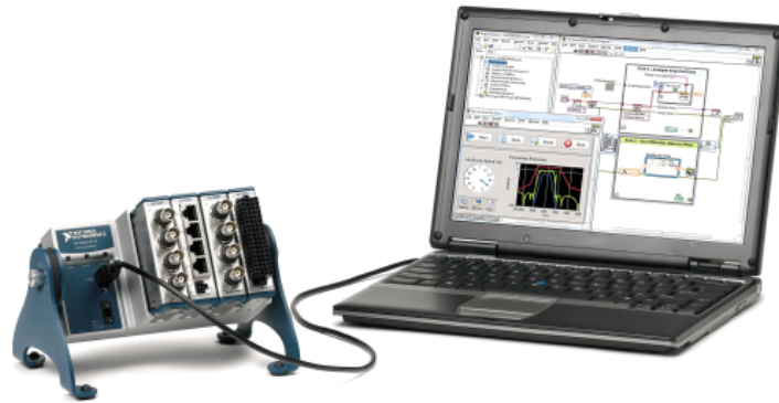
Figure 1. NI cDAQ-9174 with Three Analog and One Digital Module Connected to a Laptop

Many devices can measure temperature, voltage, or bridge-based sensors, but NI CompactDAQ can integrate all of these measurements and more into a single device that outputs all of the data via the same bus interface, such as USB. An NI CompactDAQ system can mix multiplexed voltage input signals, simultaneously sampled accelerometers, low-speed thermocouples, and TTL digital I/O all in the same 4- or 8-slot chassis using the same driver, NI-DAQmx. NI CompactDAQ makes programming easier because the same driver is used for all measurements. This solution saves space and simplifies service and support. With NI CompactDAQ, there is only one box on your lab bench, and, if there are problems with any of the measurements or equipment, award-winning National Instruments support is your contact for all your instrumentation needs.