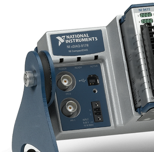
Figure 5. NI cDAQ-9178 Connections Showing BNC Triggers, Flexible Power Connector, and USB Port with Threaded Hole for Cable Strain Relief

The upgraded chassis features a new physical connection for power supplies. Each chassis is shipped with an AC/DC converter that plugs directly into the chassis. (Note that the power cord to go from the AC/DC converter to the wall is sold separately.) For other power options, such as a power supply with leads for V/C, an automotive electrical system, or an off-the-shelf battery pack, purchase the screw-terminal accessory for the chassis to enable easy connection of a V and C lead to the chassis. NI CompactDAQ requires a 9 to 30 VDC power supply and uses a maximum load 15 W of power.